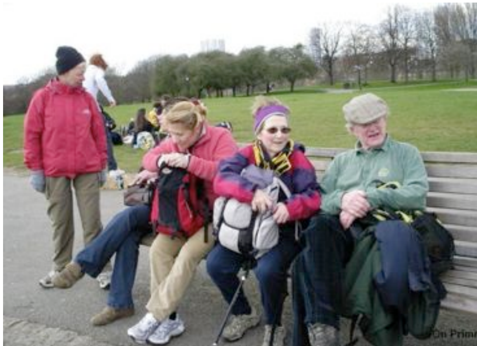
It must be somewhere in my bag! London Parks Perambulation