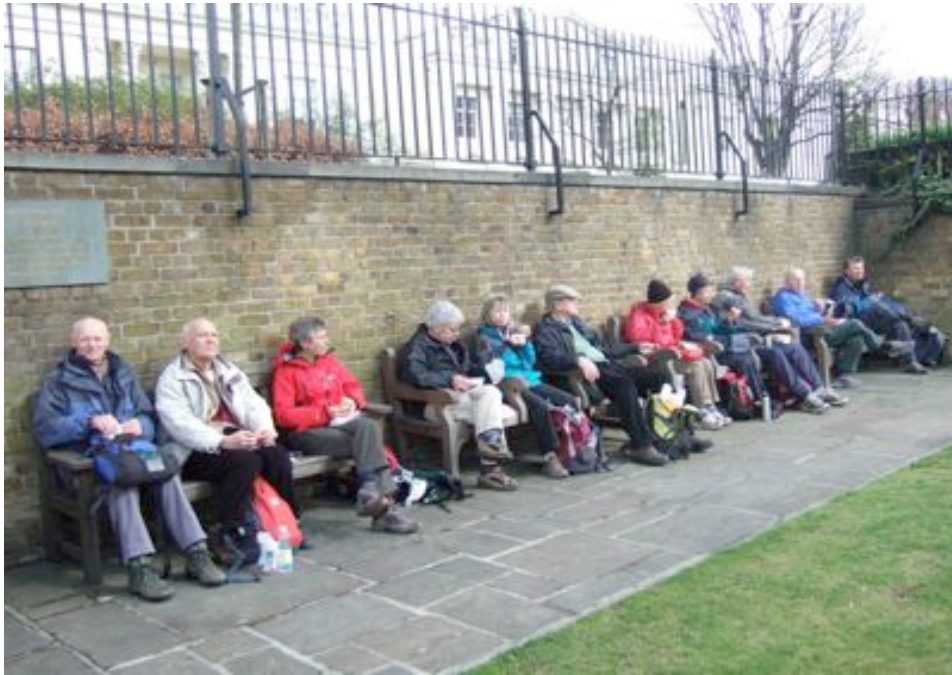
Lunch in Little Venice London Walks Perambulation